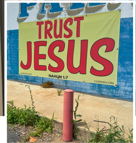
Sign found on Lynch Drive a few blocks from STEP Rose City

STEP is excited about expanding into our third mentoring site with the launch of STEP Rose City! Through the generous support of a donor, STEP has purchased and is restoring the former Calvary Baptist Church gym located at 5021 Lynch Drive in the heart of the Rose City neighborhood of North Little Rock.